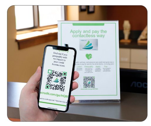
QR code to enable clients to scan with their mobile device